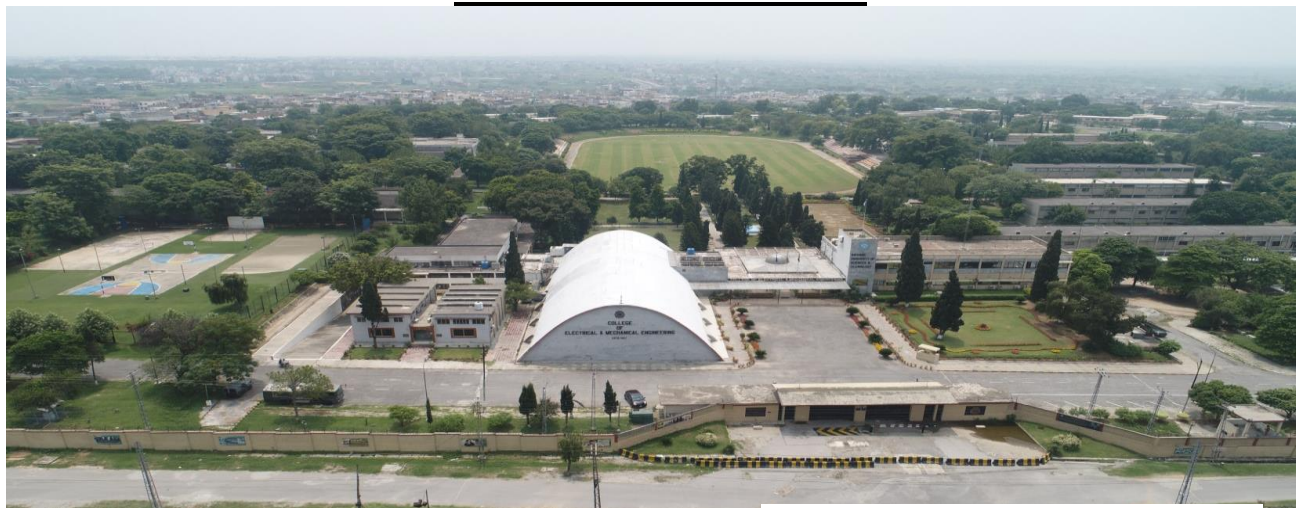
Panoramic View of Scenic Campus