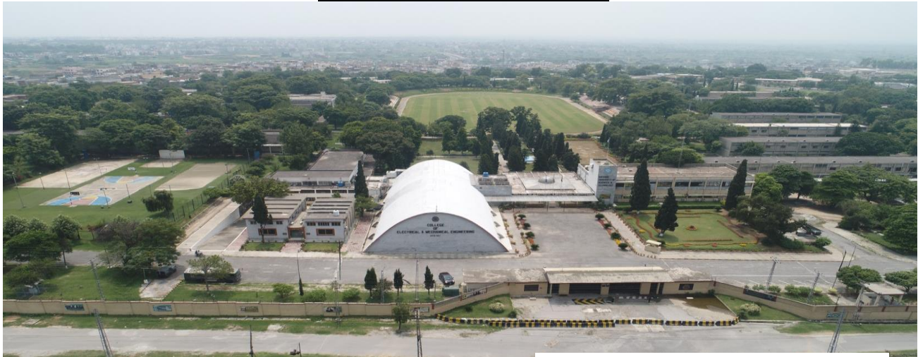
Panoramic View of Scenic Campus