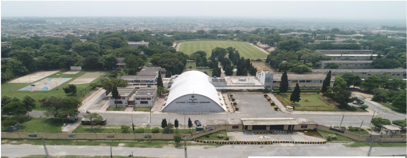
Panoramic View of Scenic Campus